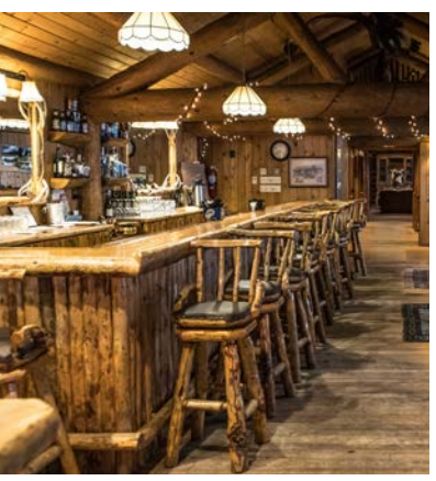
RUSTIC AND GOURMET The riding is fabulous, but the food and drink are equally perfect!

this one out of the park is an understatement. I was a frazzled weekend widow who had become used to paper plates and chicken nuggets. Ryan, as the man who whisked me away to this picturesque lodge with food fit for a king, instantly became my Knight in Shining Armor. My man is always more attractive as I'm looking up from my ganachecovered cake too!